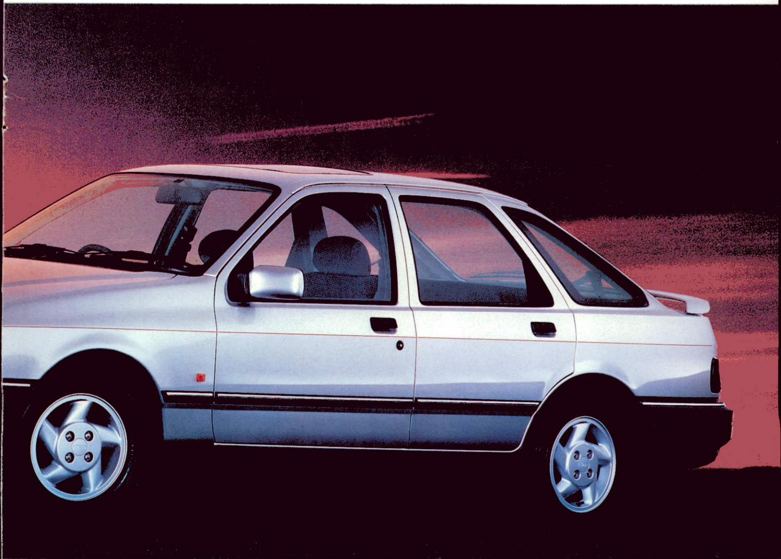
The Special Edition Sierra Chasseur